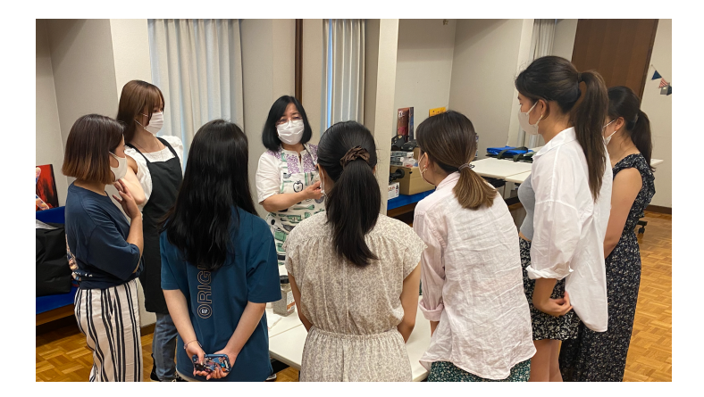
(†students at Boishaki Mera Festival 2022)