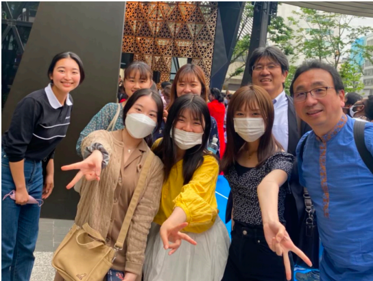
(↑students at Boishaki Mera Festival 2022)

The time at ACEF and service learning program taught me that rather than focusing on the final goal of solving social issues, I can focus on how I may prepare myself to become more resourceful, and to notice where I stand in relation to such social issues.”