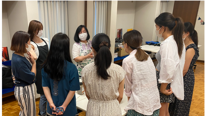
(↑students learning how to make Bangladeshi curry)