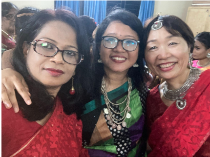
↑With new BDP staffs hired last year