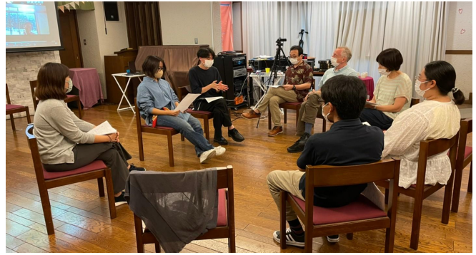
↑ Dignity Cafe 9/3