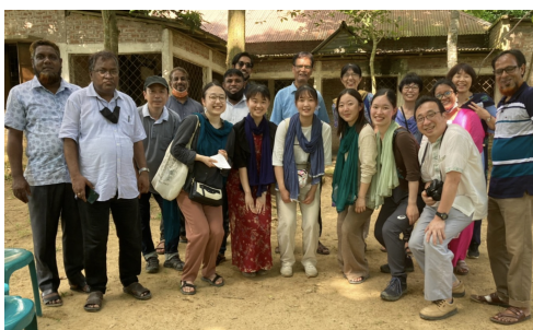
↑Study Tour 2022