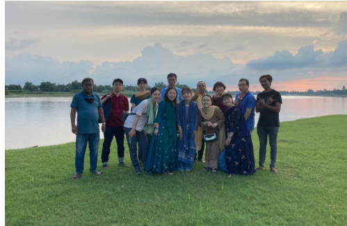
↑From boat trip during Study Tour 2022