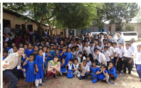
↑Study Tour 2019