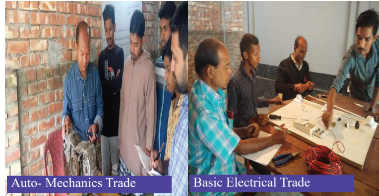
Auto- Mechanics Trade