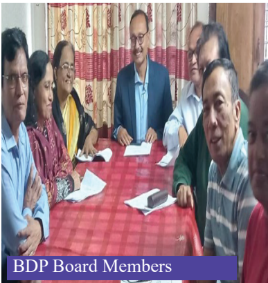
BDP Board Members

BDP has many success stories. Many of BDP graduated students are now in good position in the society. Among them some are Doctors, Army Officers, Bank Managers and Engineers and also leaders in the society.