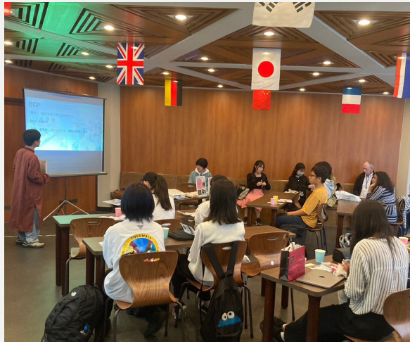
← Handicraft seminar at Seabury Chapel