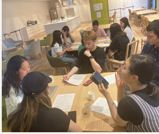
← Dignity Cafe at Wisteria Hall in Momi dormitory