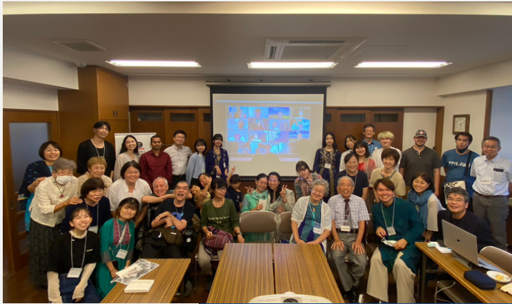
↑2023 ACEF Autumn Seminar