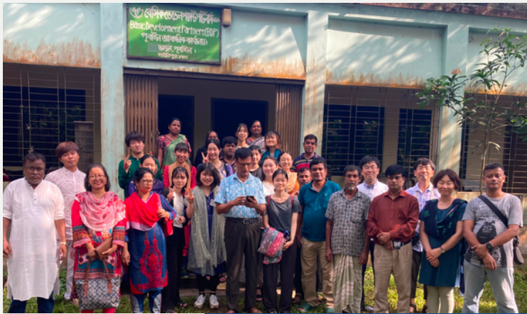
↑ 2023 ACEF Bangladesh Study Tour