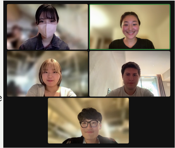
ICU Service Learning: 2023 Autumn

ACEF YOUTH engages in diverse activities, including SNS broadcasting and volunteering for handicraft activities at the ACEF office in Waseda. Each individual's passions are utilized. If you are interested, please feel free to contact us!